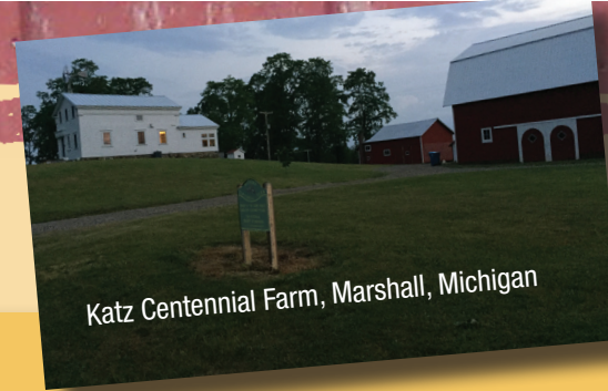
Katz Centennial Farm, Marshall, Michigan

The Barn Believers Community Project Fund informs, inspires, and connects people with traditional barns to encourage their continuing use in agriculture, community, and the economy.